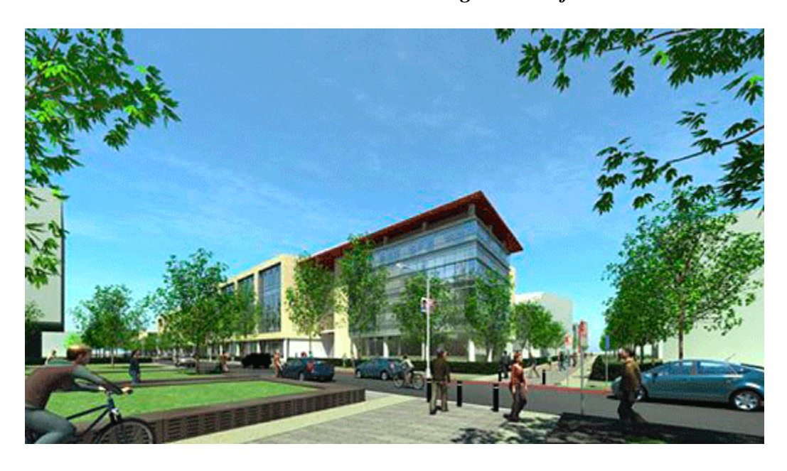
From Academic Walk looking at FIM1 in relation to CCSR