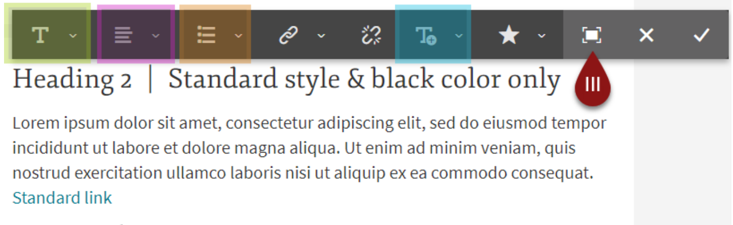
Quick Edit mode